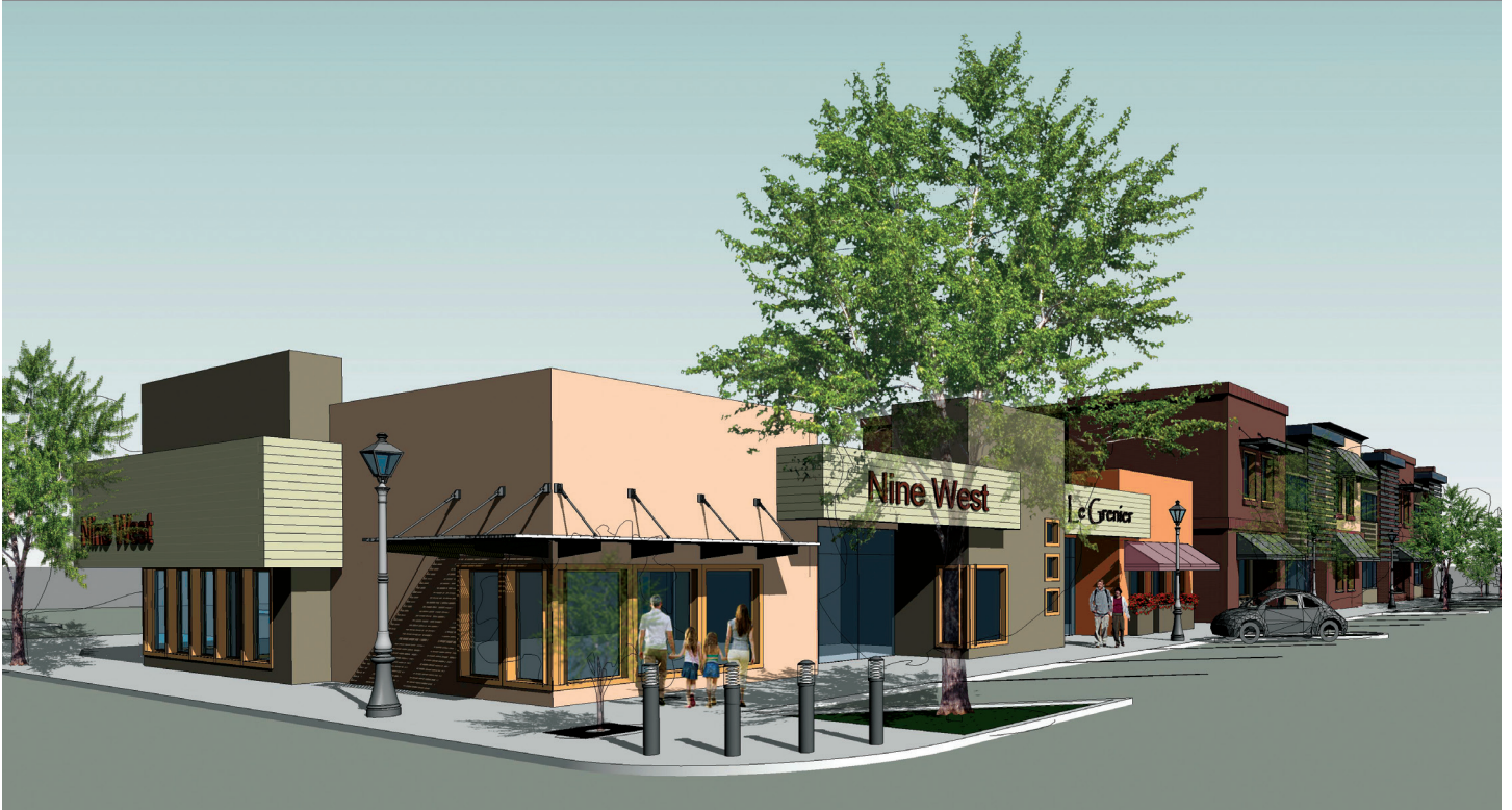
Above: Retail View Below: Main Street View