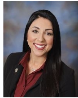
District 4 Councilmember Natasha Johnson Elected 2020