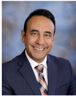
District 2 Mayor Steve Manos Elected 2020