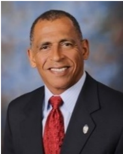
District 1 Mayor Pro Tem Brian Tisdale Elected 2020