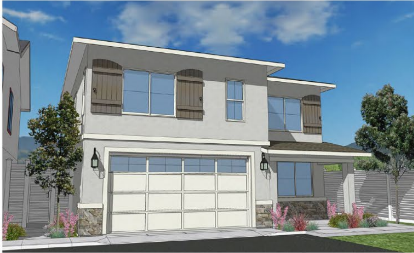
PLAN 4 FRENCH COUNTRY