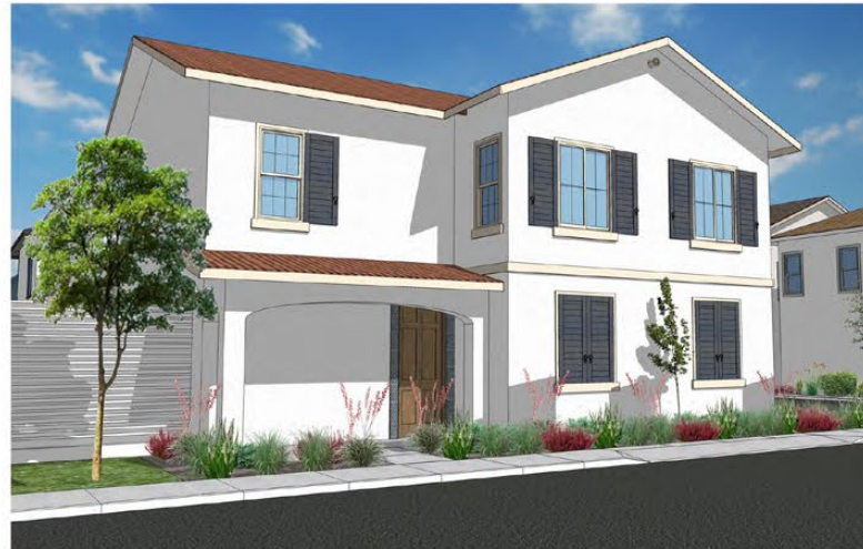
PLAN 3 SANTA BARBARA