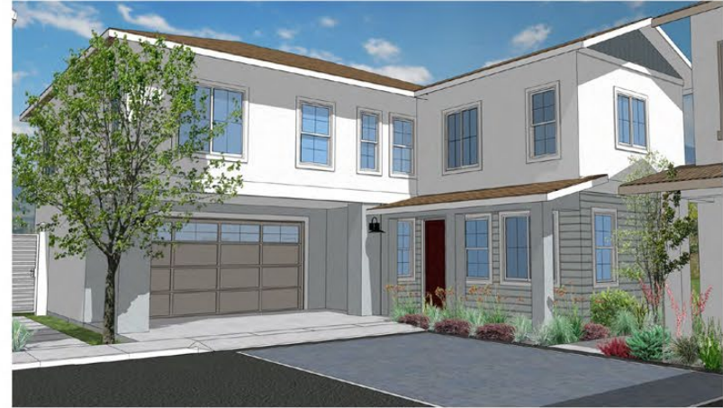
PLAN 3 MODERN FARMHOUSE