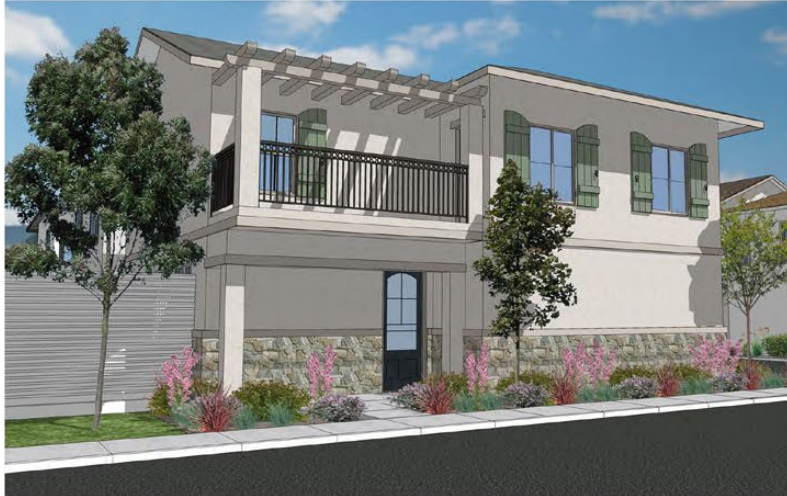
PLAN 3 FRENCH COUNTRY