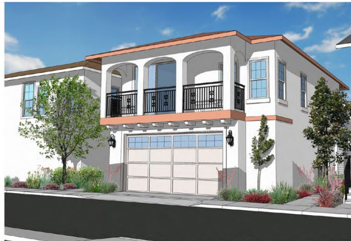
PLAN 1 SANTA BARBARA