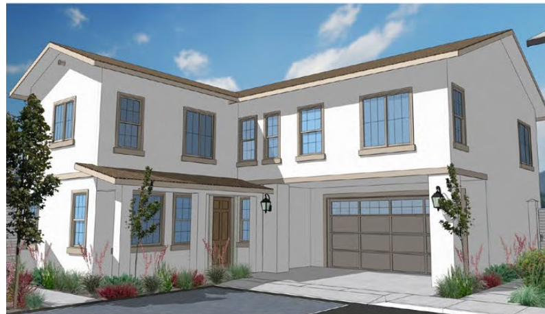
PLAN 3 SANTA BARBARA