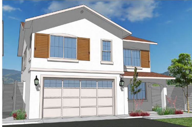
PLAN 4 SANTA BARBARA