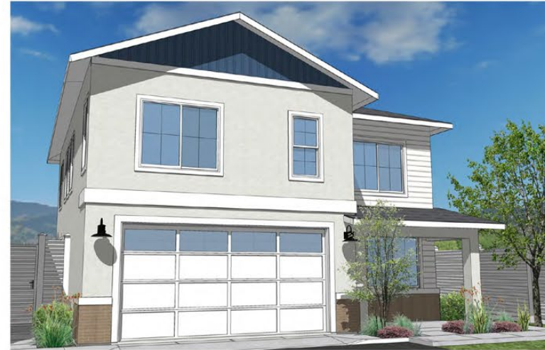
PLAN 4 MODERN FARMHOUSE