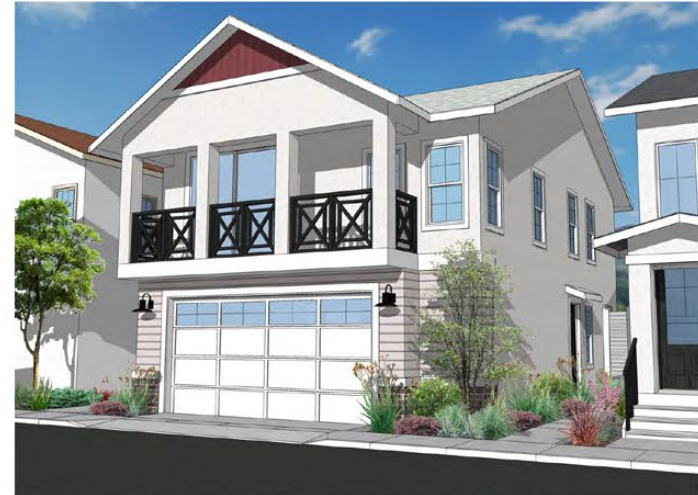
PLAN 1 MODERN FARMHOUSE