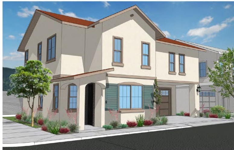
PLAN 2 SANTA BARBARA