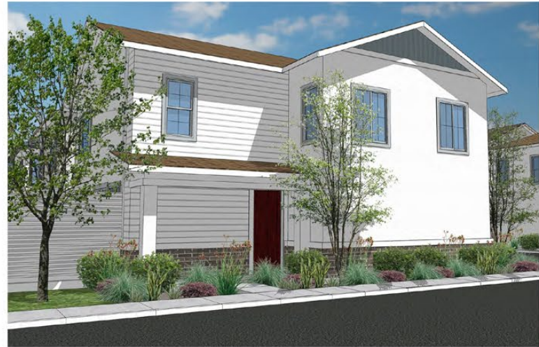
PLAN 3 MODERN FARMHOUSE