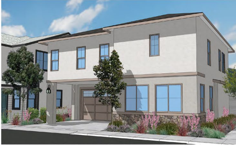
PLAN 1 FRENCH COUNTRY