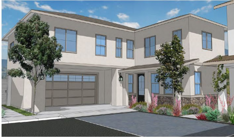
PLAN 3 FRENCH COUNTRY