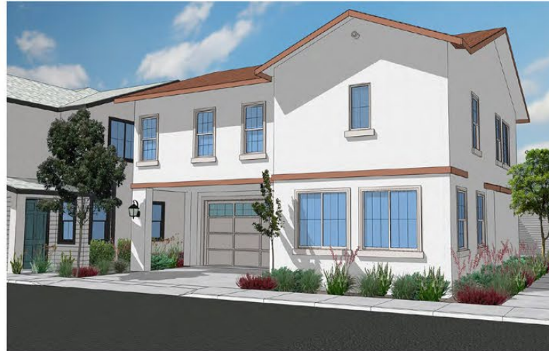
PLAN 1 SANTA BARBARA