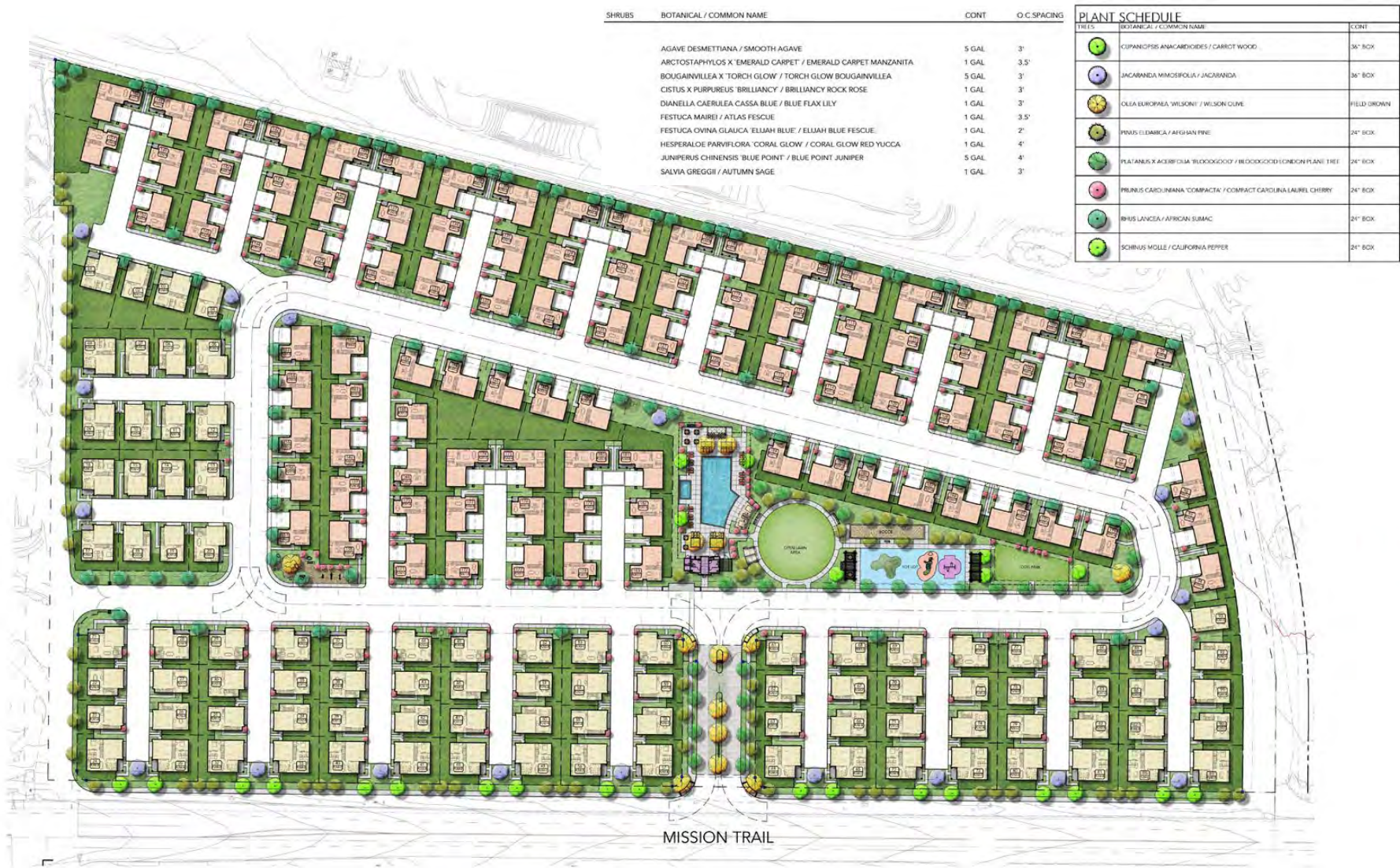
Mission Trail Residential City of Lake Elsinore