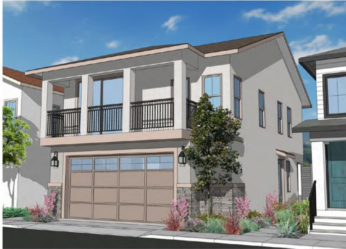
PLAN 1 FRENCH COUNTRY