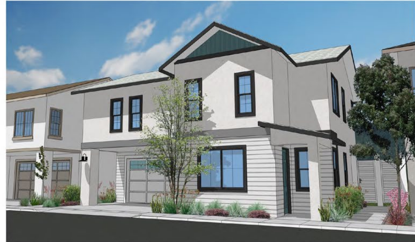
PLAN 2 MODERN FARMHOUSE