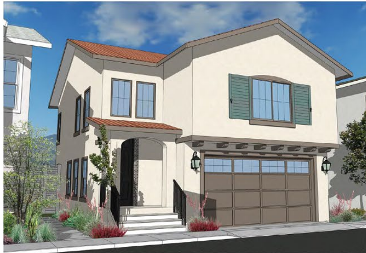
PLAN 2 SANTA BARBARA