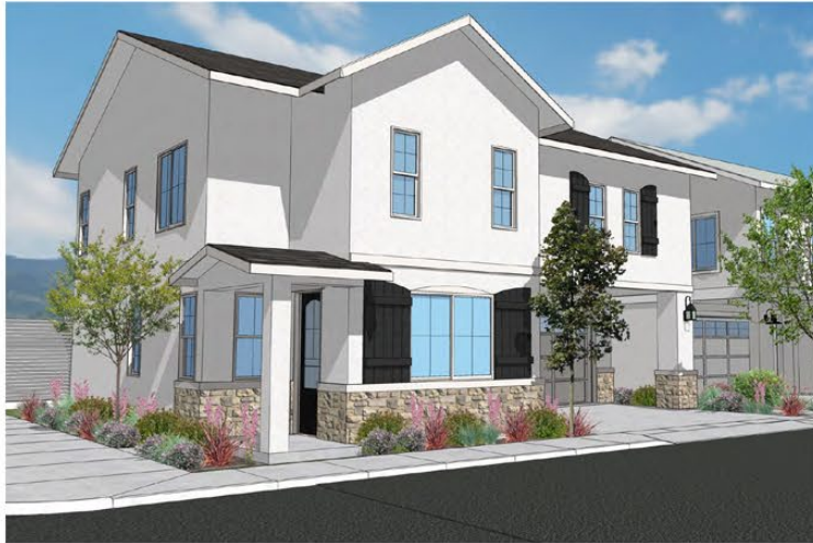
PLAN 2 FRENCH COUNTRY