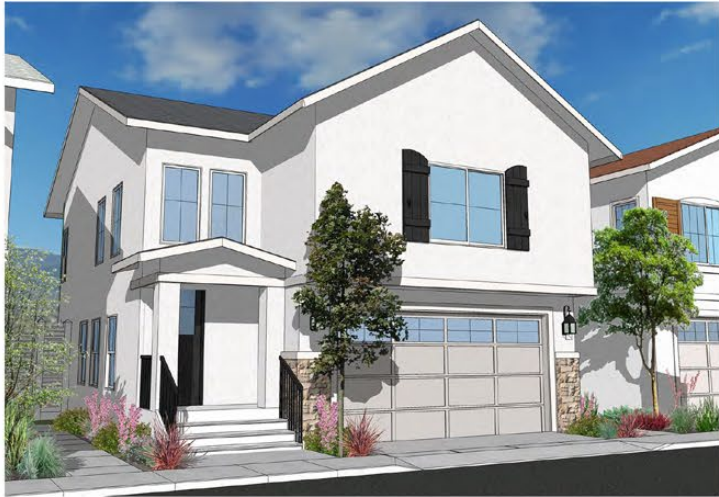
PLAN 2 FRENCH COUNTRY