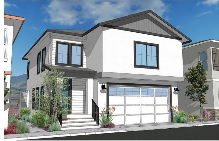
PLAN 2 MODERN FARMHOUSE