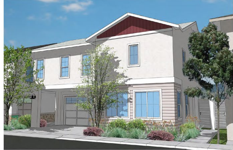
PLAN 1 MODERN FARMHOUSE