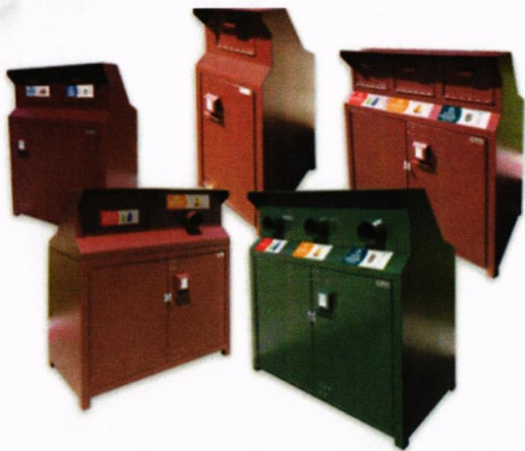
BEAR-RESISTANT "CE SERIES" TRASH CANS AND RECYCLE BINS