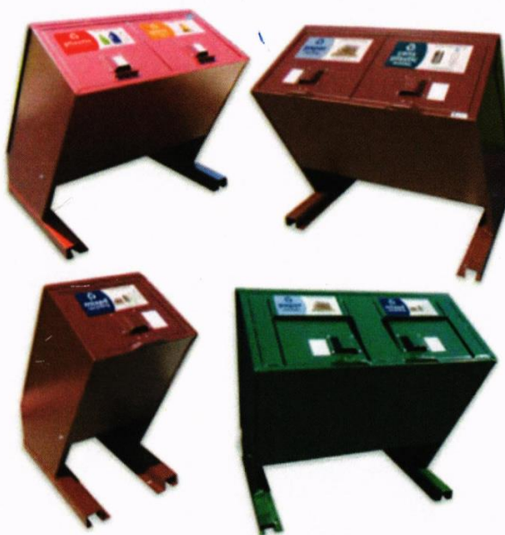
BEAR-RESISTANT "HID-A-BAG" TRASH CANS AND RECYCLE BINS