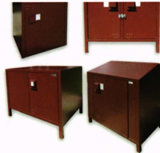
BEAR-RESISTANT FOOD STORAGE LOCKERS