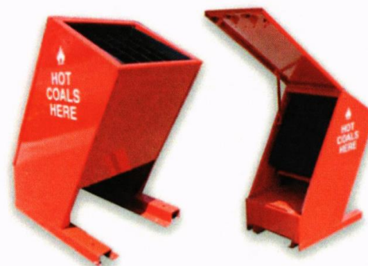
BEAR-RESISTANT "BEARIER™" RESIDENTIAL/MUNICIPAL CAN ENCLOSURES