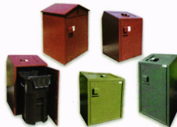
BEAR-RESISTANT "BEARIER™" RESIDENTIAL/MUNICIPAL CAN ENCLOSURES