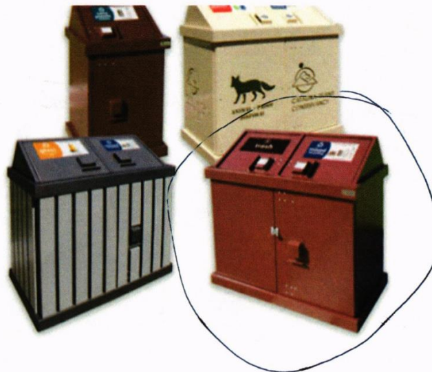
BEAR-RESISTANT "HA SERIES" TRASH CANS AND RECYCLE BINS