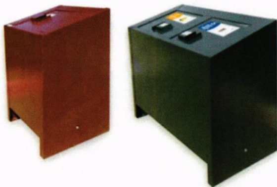
BEAR-RESISTANT "BE SERIES" TRASH CANS AND RECYCLE BINS