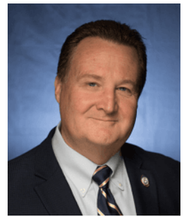
District 5 Councilmember Bob Magee Elected 2020