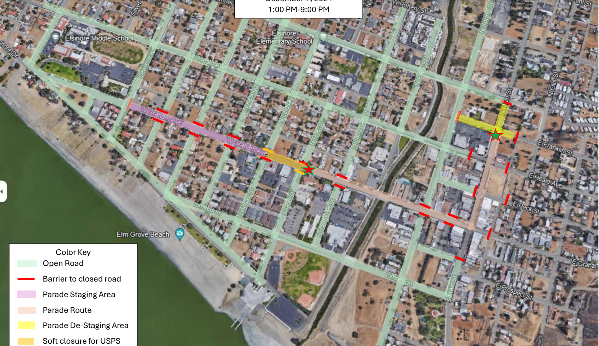
Winterfest Parade Closure Map December 7, 2024 1:00 PM-9:00 PM